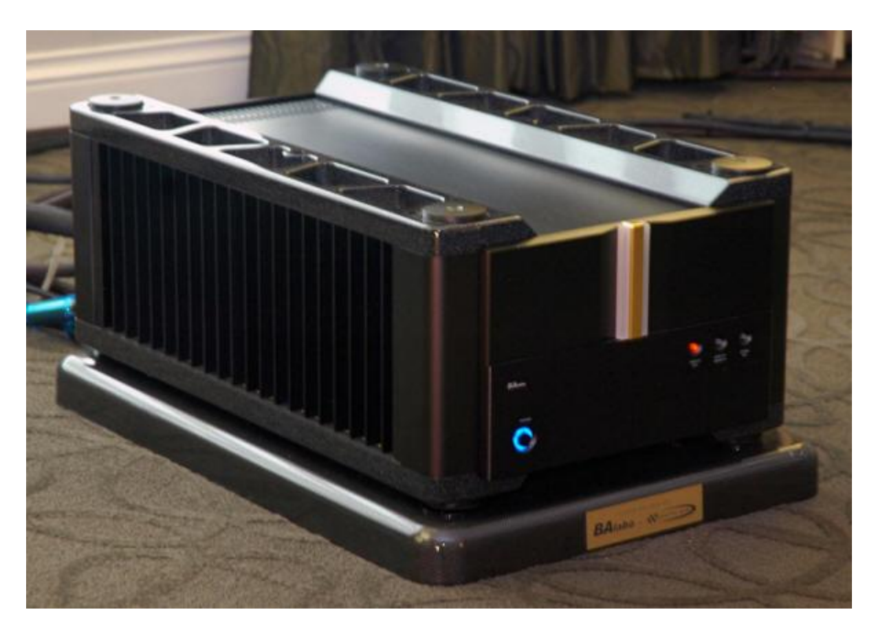
The impressive looking and sounding BAlabo BP-1 Mk II stereo amplifier